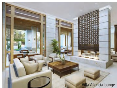
Villa Valencia lounge