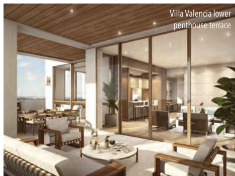
Villa Valencia lower penthouse terrace