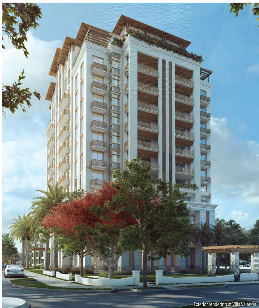
Exterior rendering of Villa Valencia

VILLA VALENCIA 515 Valencia Ave., Coral Gables; villavalencia.com DEVELOPER: Location Ventures | ARCHITECT: Hamed Rodriguez Architects STORIES: 13 | RESIDENCES: 2,616-6,263 sq. ft. | Starting at $1.65 million SCHEDULED COMPLETION: Summer 2021