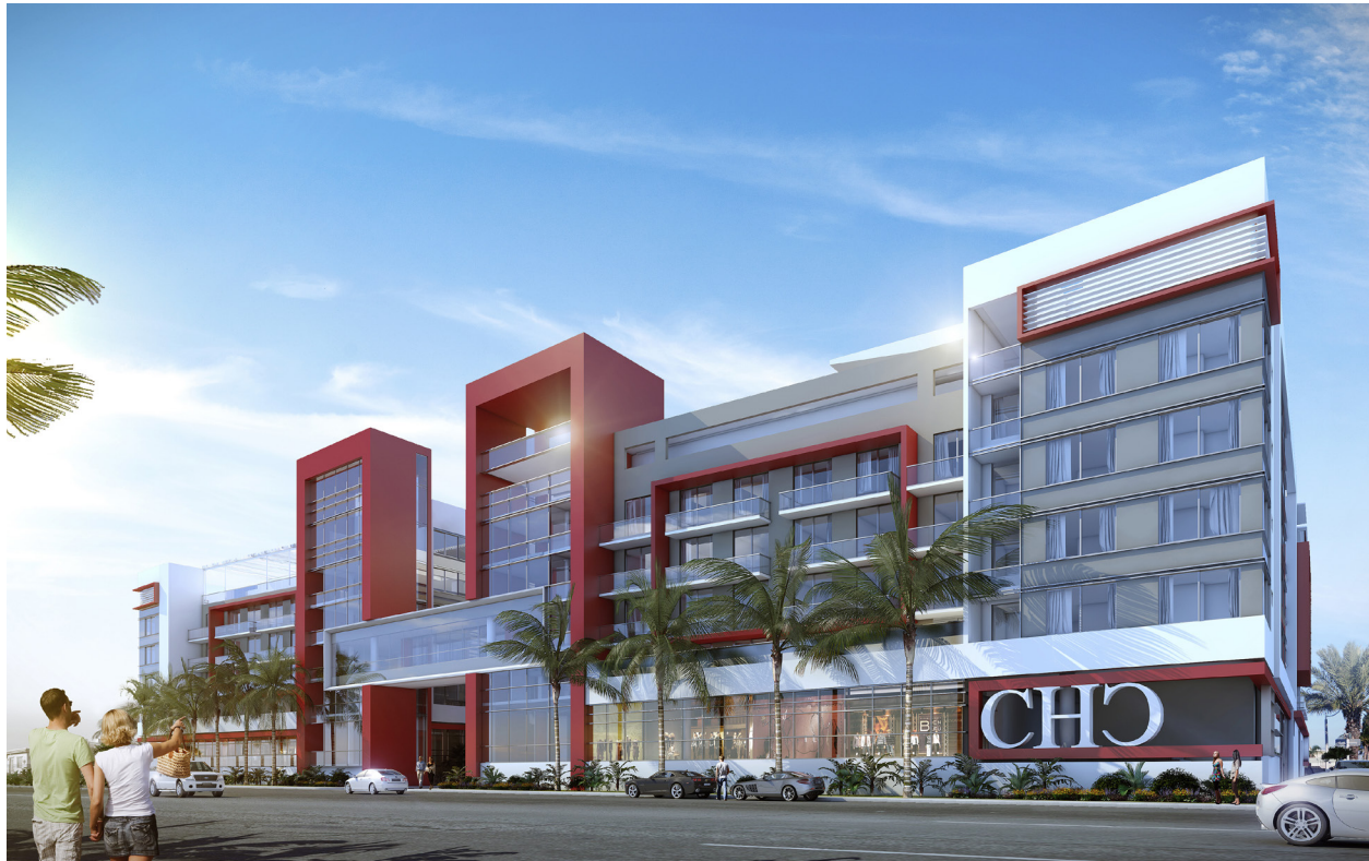
Costa Hollywood Hotel