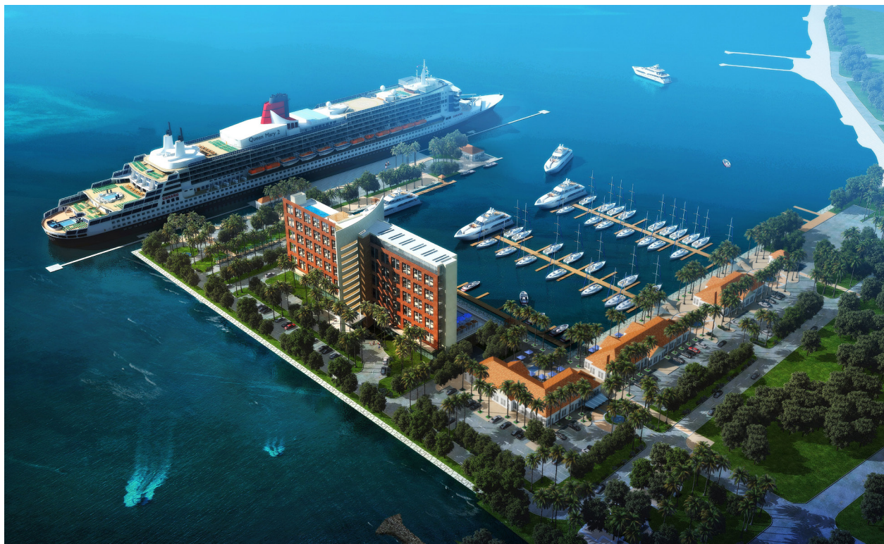
Hyatt Park, Cartagena

Hyatt Place Miami 455 Bayshore Drive, Miami, FL 250,000 sf 192 Key Hotel Design & City Approval