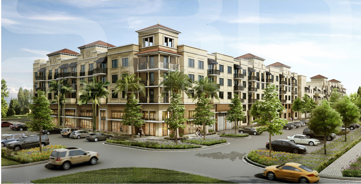
Modera Plantation, Plantation, FL