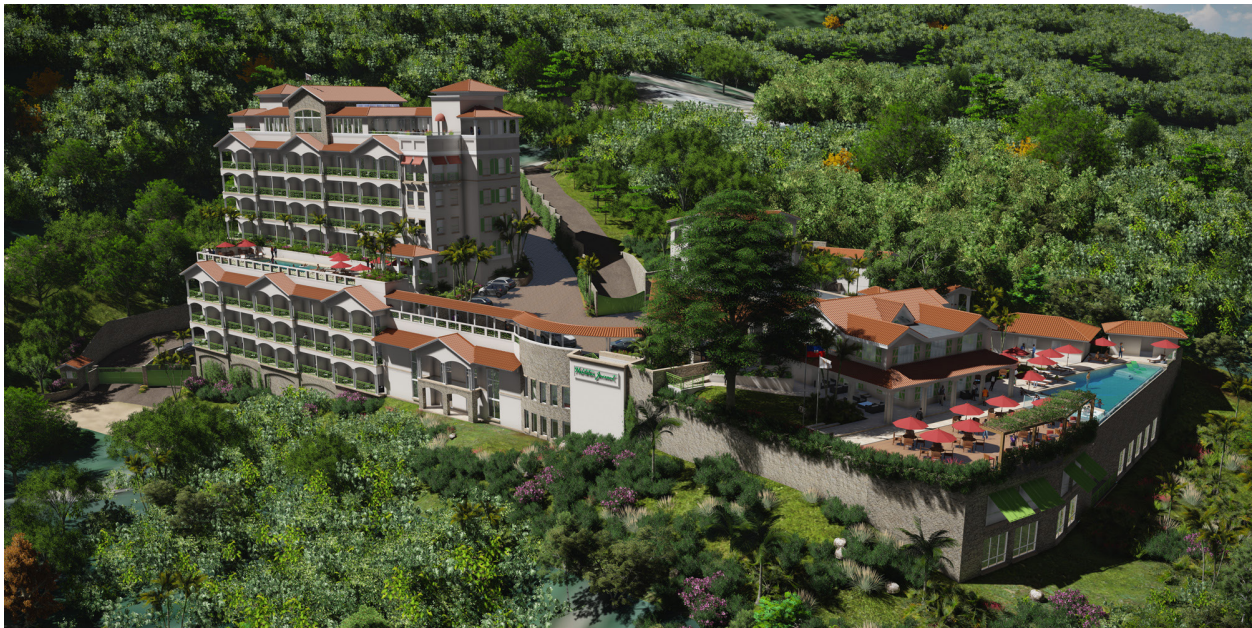
Marriot Autograph Collection Habitation Jouissant, Cap Haitien, Haiti

📍 275 Minorca Ave. Coral Gables, FL 33134