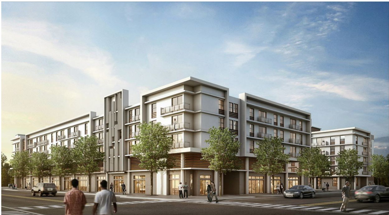
St. John Plaza Apartments, Miami [H.U.D.]

Teatro Marti Apartments [HUD] 27 unit Apartment complex Miami, Florida Construction Cost: $2,000,000.00 Client: Biscayne Housing Group Inc.