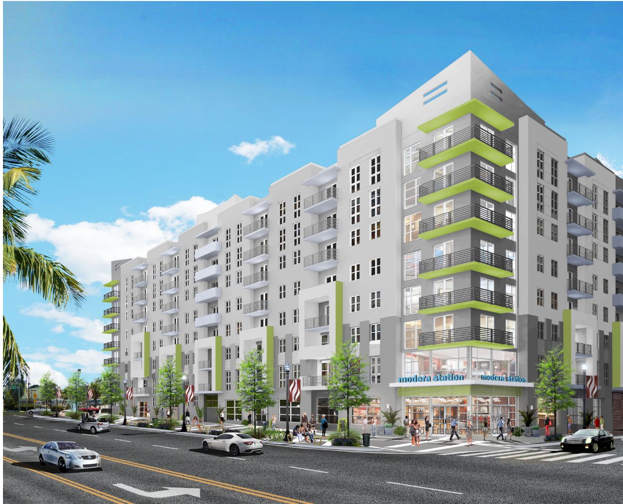
Modera Coral Gables

Modera Bird 262 unit apartment complex Miami, Florida Construction Cost: $32,000,000.00 Client: Mill Creek Residential Trust