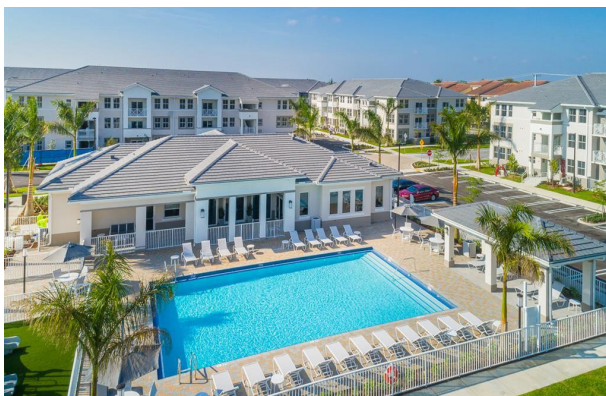
Alcazar Apartments [H.U.D.]