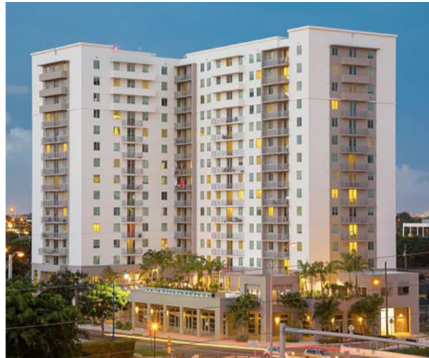
The Plaza I, Student Housing in Sweetwater, Florida