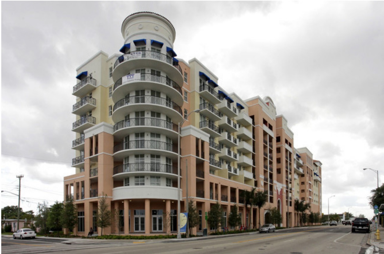
Dr. Barbara Carey Shuler Manor [H.U.D.]