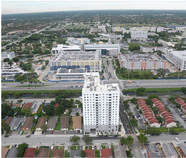
The Plaza I, Student Housing in Sweetwater, Florida

Ponciana Lakes Apartments 208 unit apartment complex Davie, Florida Construction Cost: $15,750,000.00 Client: Dayco Holding, Corp.