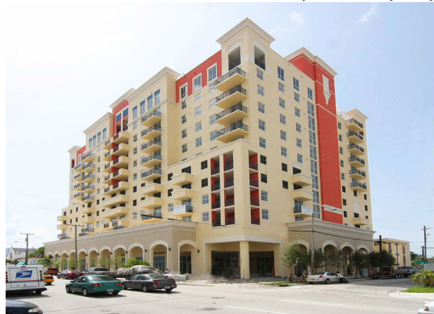
Villa Aurora Mixed - Used Building [HUD]