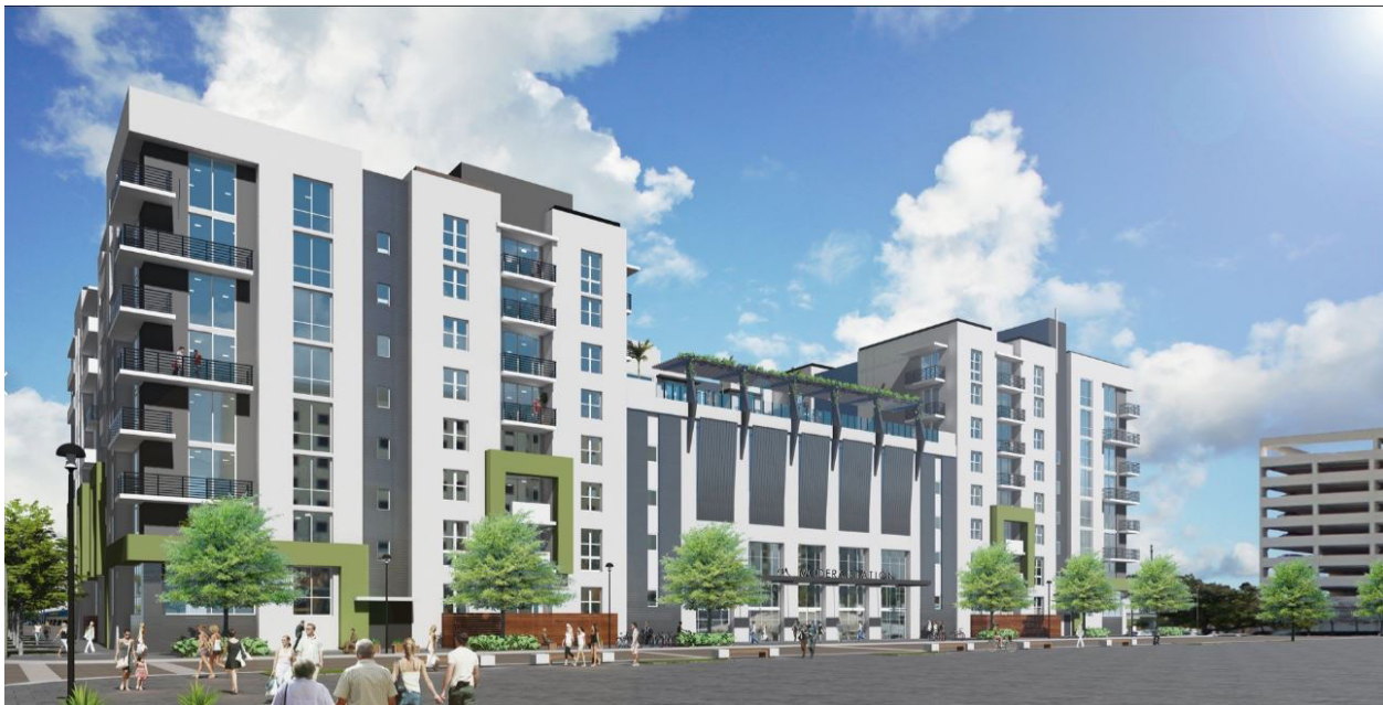
Modera Station II, Miami, FL