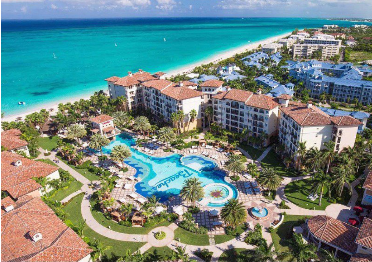
Beaches Turks and Caicos