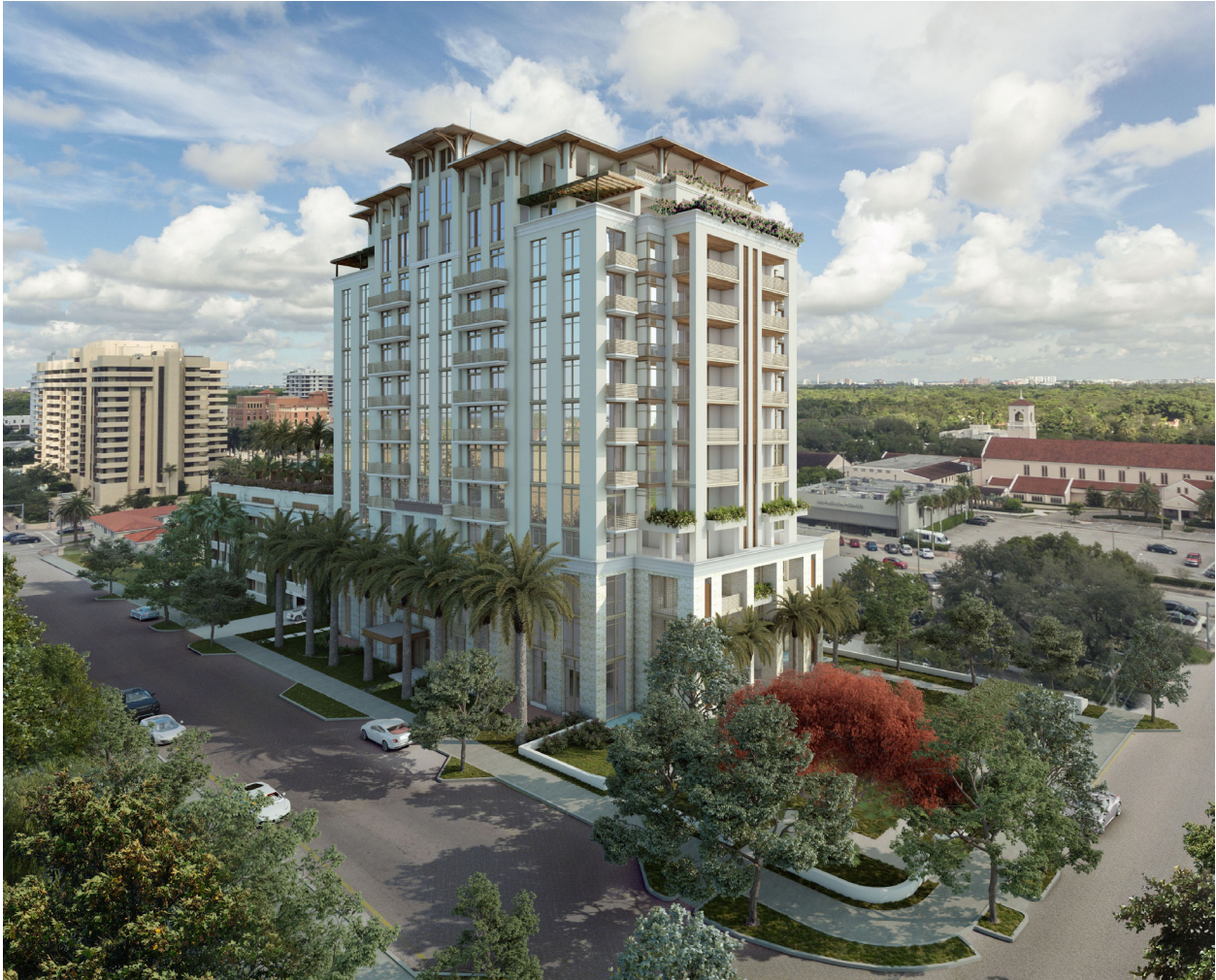
Villa Valencia Condos, Coral Gables

In association with: Eddy Frances Architecture PLLC