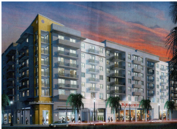
Rex Art, Miami